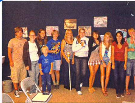
Volunteers at the Aquarium of the Pacific reward trip

2008 has come and gone, but was overall a very good year at Doheny. We had some great events including the Surf-a-Rama, Stand-up paddle race, Hobie Cat 40-year anniversary regatta, and several others put on by our local Doheny Longboard Surfing Association. Of course, we did campfire programs every Saturday night all summer. The volunteers and staff have really spruced up the campfire center. Come by sometime and take a look. The Hallow-