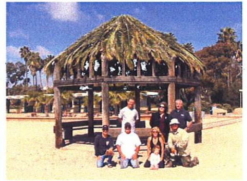
The Doheny Longboarders palapa roofing crew